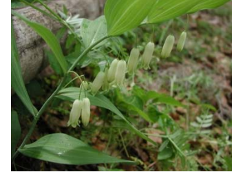
9. Smooth Solomon's Seal