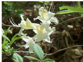
14. Alabama Azalea