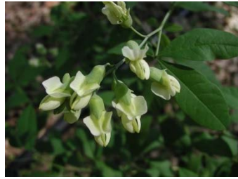
7. Apalachicola Wild Indigo