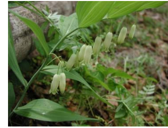
9. Smooth Solomon's Seal