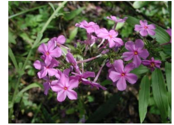
10. Smooth Phlox