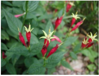
1. Indian Pink