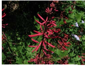
3. Coral Bean