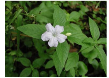
5. Carolina Wild Petunia