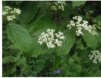
8. Arrowwood Viburnum