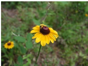
13. Black-eyed Susan