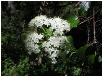
11. Rusty Blackhaw