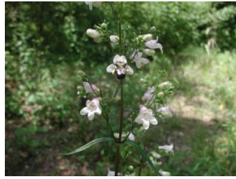
2. Smooth Beardtongue