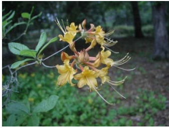
6. Florida Flame Azalea