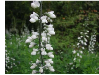
4. White Wild Indigo